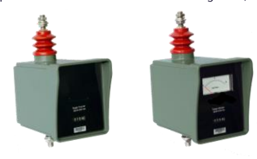
Figure 1 3EX5 030 and 3EX5 050